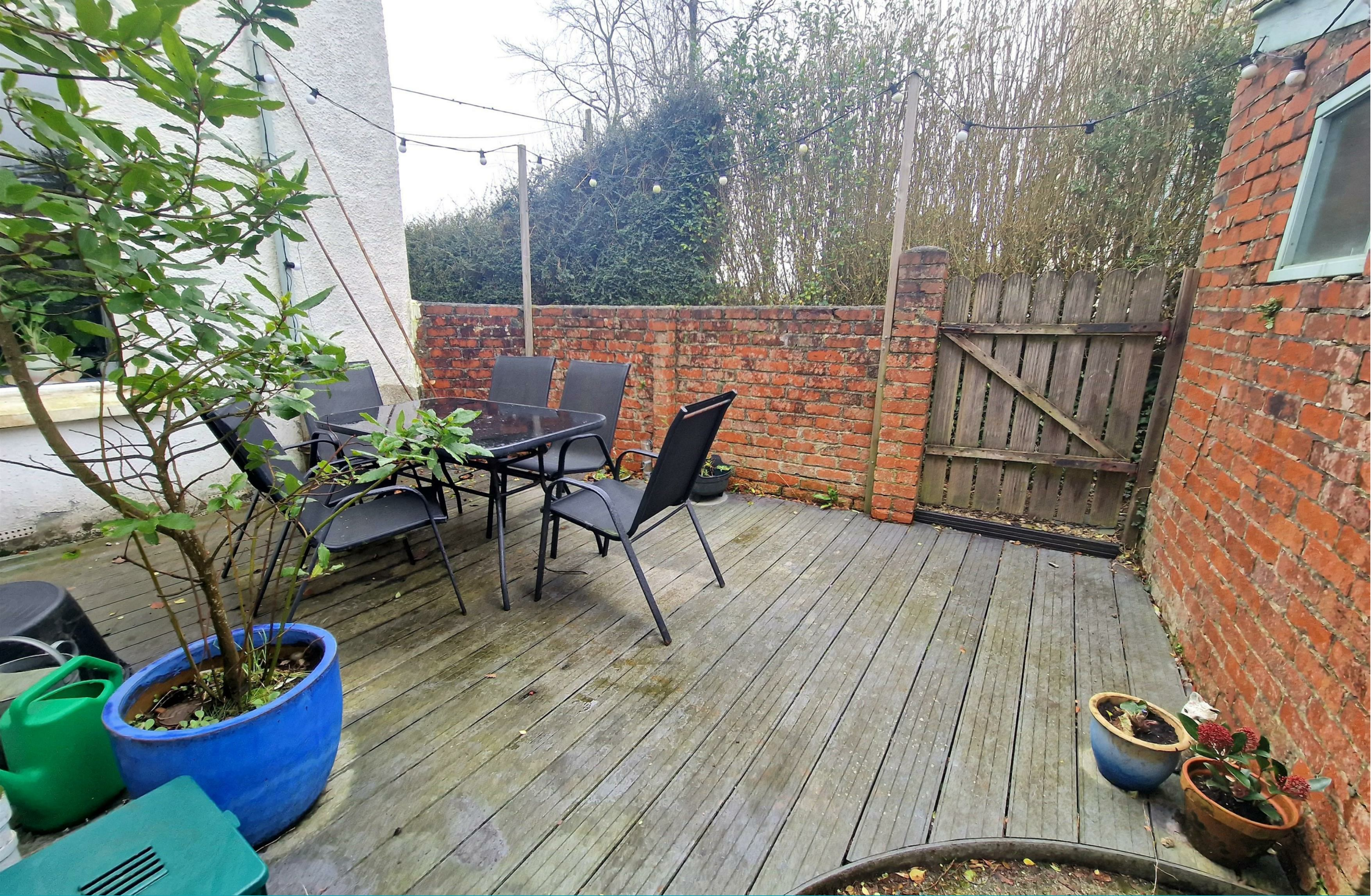
Dunheved Road, Launceston, PL15 9JH